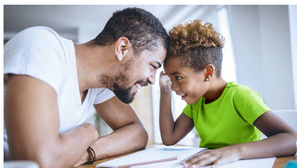
National Scientific Council on the Developing Child. (2004). Young children develop in an environment of relationships. Retrieved from https://46y5eh11fhgw3ve3ytpwxt9r-wpengine.netdna-ssl.com/wp-content/uploads/2004/04/Young-Children-Develop-in-an-Environment-of-Relationships.pdf, accessed August 19th, 2019

Mealtimes can pose a real challenge. Keeping up with dynamic conversations is made especially hard due to the complex mix of voices, background noise and clinking cutlery. For a child to be an active participant in a conversation, they need to hear everyone at the table clearly.