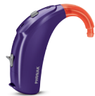
Sky V-SP Mild to profound hearing losses