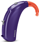
Sky V-UP Moderate to profound hearing losses